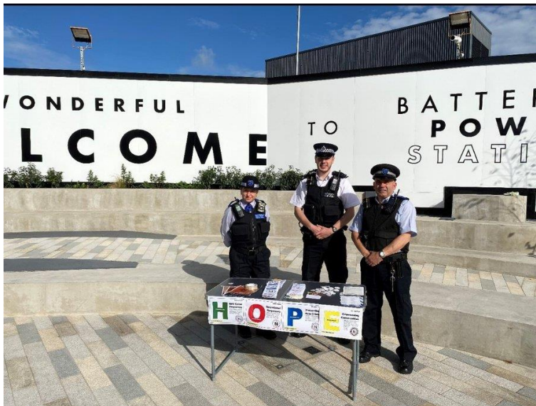
Queenstown Officers out by the Power Station for Hate Crime awareness Week.

Officers out patrolling the unlit side paths in Battersea Park due to previous reports of robberies in the area. October 22 nd .