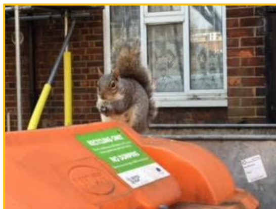
Squirrel Binman aka Oak Botherer

The Smugglers Way Household Waste and Recycling Centre remains open, but please check back here before you visit to ensure you have the latest information on any new measures we may introduce to keep you and Centre staff safe.