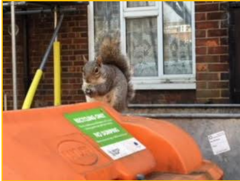
Squirrel Binman aka Oak Botherer

The Smugglers Way Household Waste and Recycling Centre remains open, but please check back here before you visit to ensure you have the latest information on any new measures we may introduce to keep you and Centre staff safe.