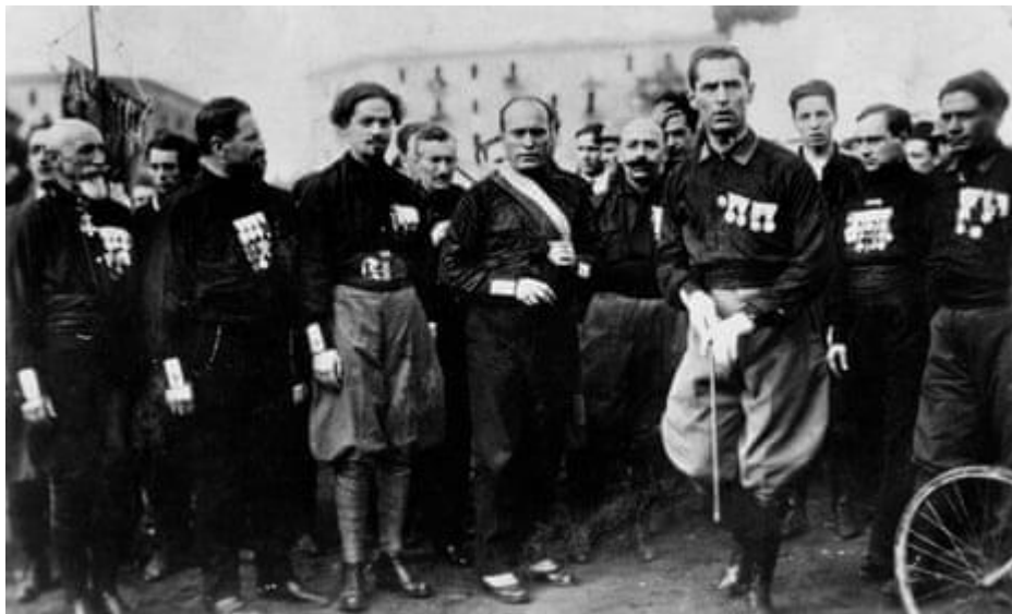
Benito Mussolini among the Quadrumvirs on 24 October 1922.

The Observer examines the fascist advance across Italy and Mussolini’s ability to dominate an audience ‘by sheer force of volcanic personality’