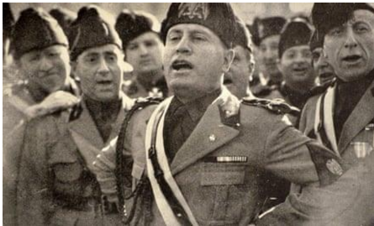
Mussolini in Rome, February 1927.

The very day that the prime minister’s 3,000 distinguished guests were eating their excellent dinner and exchanging “ bei complimenti ,” Mussolini was taking peaceful possession of enemy country. The beautiful little city of Cremona, lying in the rich Lombard plain close to the gliding waters of the Po, awoke to find her population suddenly doubled by the advent of 30,000 fascists – youths in black shirts and black fezes, skull and crossbones as their emblem, their motto “ Me ne frego ” (“ Je m’en fiche ”); and young girls in short black skirts, white blouses, and jockey caps made of tricolour.