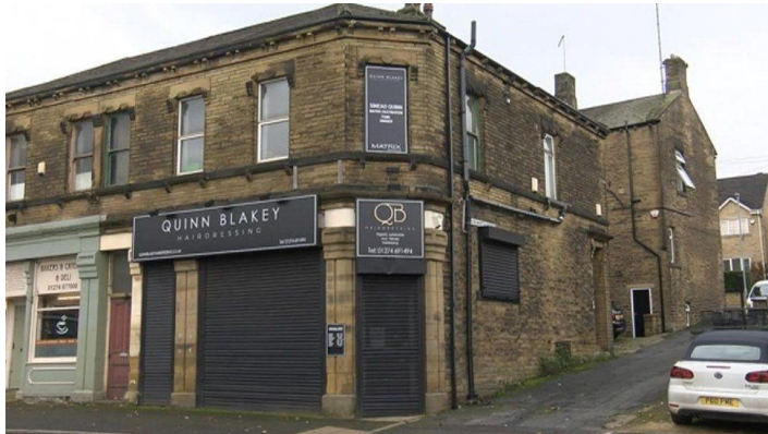
image captionThe owner of the Quinn Blakey hair salon has been fined thousands despite citing Magna Carta as a justification for opening