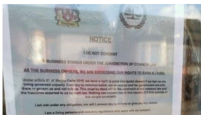
image caption Some businesses have used a misleading notice found on the internet to justify staying open