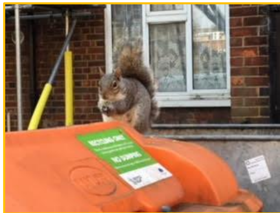
Squirrel Binman aka Oak Botherer